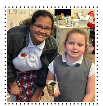
St. Augustine students and their seedlings